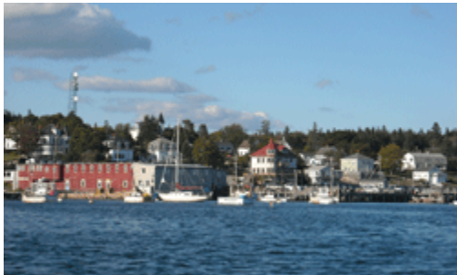
State of Coastal and Marine Management in Maine

Maine's coastal and marine resources are important to the health of Maine's coastal municipalities and economy. We provide an overview of the current state of coastal marine management in Maine and conduct a spatial analysis of the current jurisdictional management zones off the coast of Maine.